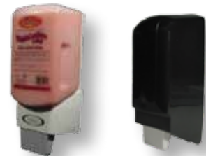
P-175-K (left) P-175-K-C-B (right) 1.75 Liter Dispensers. The K-C-B model is covered with a key lock.