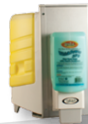
Tri-Sided Bradley Sink Adapter For P-175-K & P-400 Series Dispensers