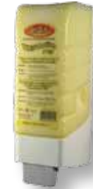
P-400-M A 4 Liter, (4000 mL) dispenser for foam or liquid.